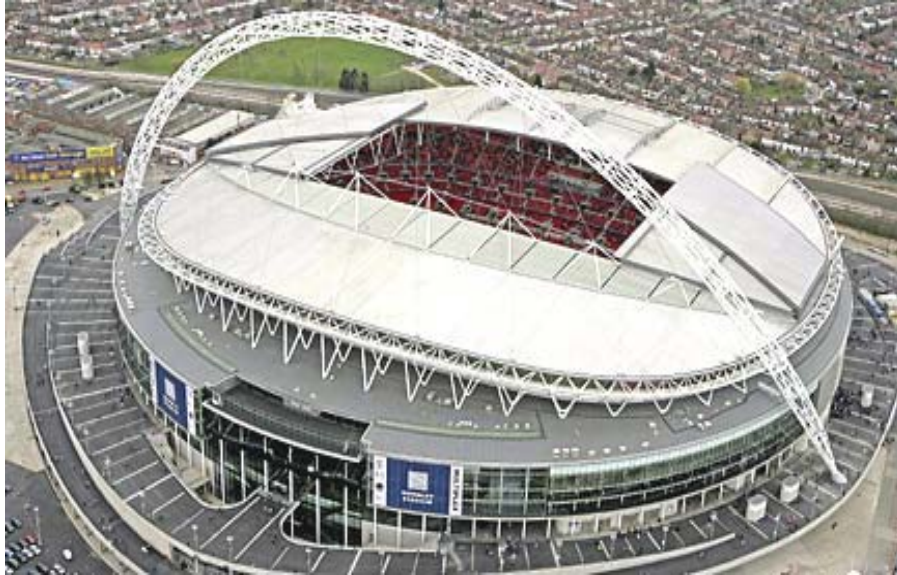
Figure 1 – The completed stadium

Australian builder Multiplex won the ‘Guaranteed Maximum Price’ (GMP) contract to design and construct a new, world-class 90,000 seat Wembley football stadium. Work commenced in September, 2002, with completion planned well ahead of the FA Cup Final in May 2006. The stadium was eventually finished just in time for the 2007 FA Cup Final.