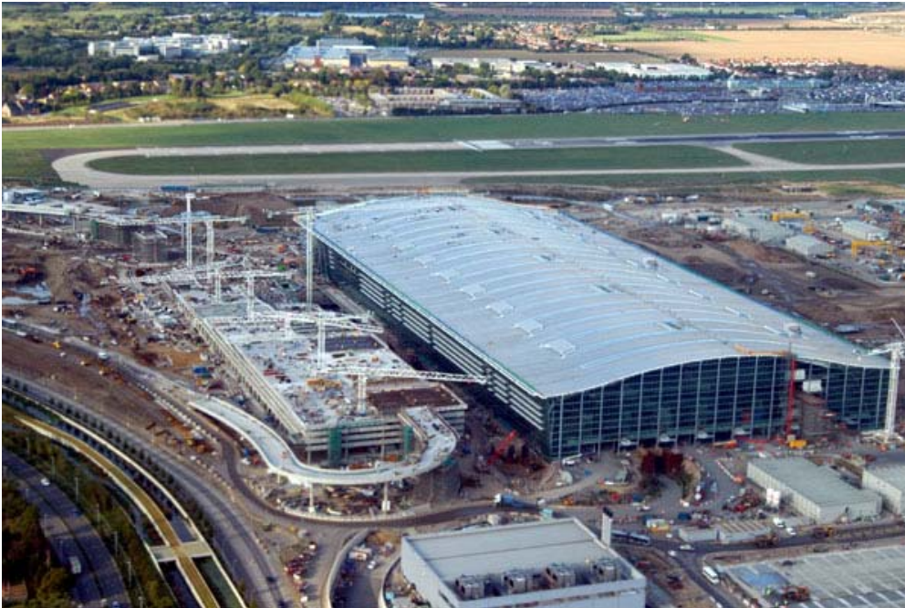
Figure 2 – T5 under construction, September 2005

At £4.3 billion, T5 was the biggest construction project in Europe (Figure 2), yet it appears to have run like clockwork, completed on schedule and 'under budget'. Its success is attributed to the commitment made by the client, BAA Limited (BAA), to an entirely different way of working focused on proactive collaboration with its contractors.